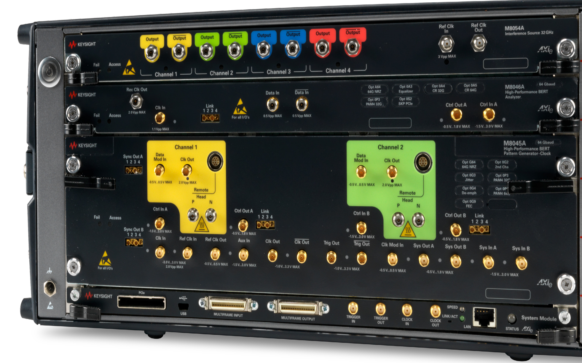
M8040A 64 Gbaud high-performance BERT