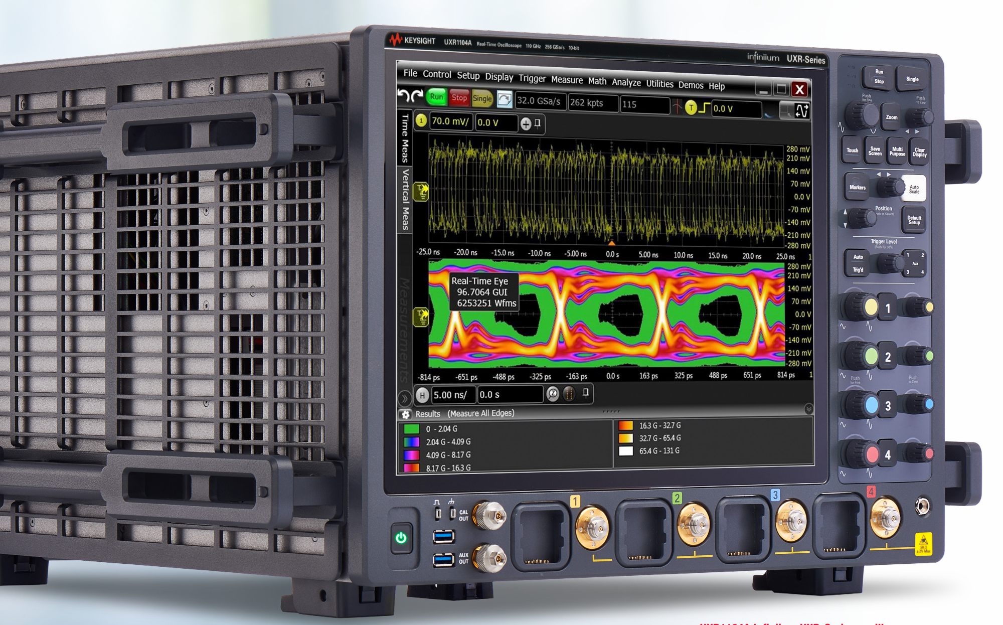
UXR1104A Infiniium UXR-Series oscilloscope